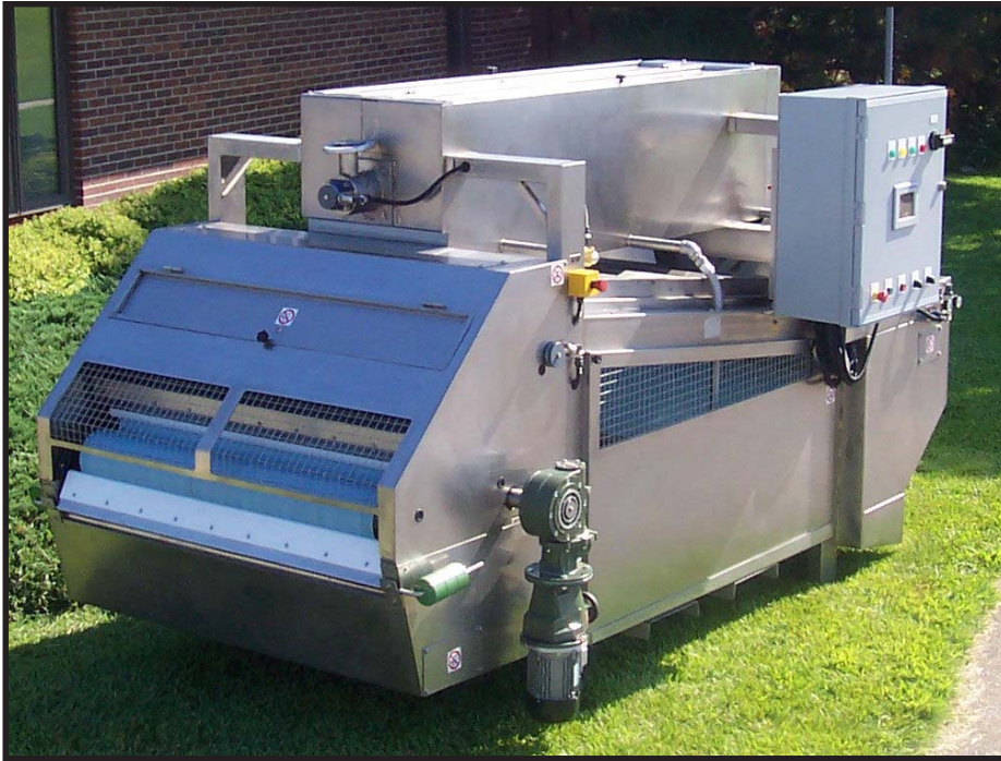
The TRITAN dewatering belt press provides three belt performance with single belt tracking.

The TRITAN is a cost effective solution that combines a sludge pre-thickener with a belt press in one unit. This streamline design eliminates the need for two separate pieces of equipment, reducing the equipment footprint. Simplicity is the TRITAN . This operator friendly belt press offers three belt performance providing excellent dewatering and a dry cake comparable to traditional equipment, but with less moving parts. The seamless belt, together with the drive